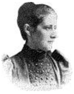
About Beatrix Potter (1866-1943)